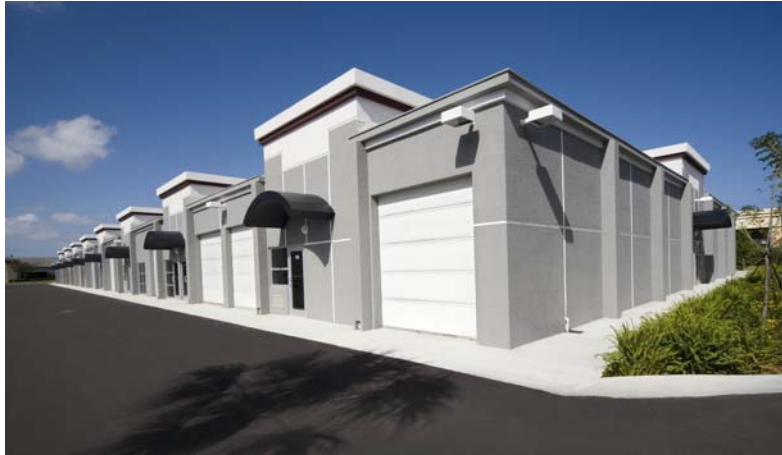
Holland Drive Industrial Park 1020 Holland Drive, Boca Raton, FL 33487